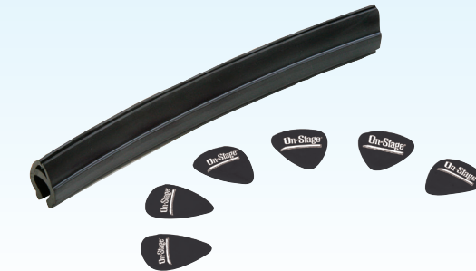
MICROPHONE STAND PICK HOLDER GSAPK6600 | 53786 | BLACK PICKS GSAPK6700 | 60809 | PURPLE PICKS

Application: Holds up to 5 medium-weight picks. Materials: Molded plastic with adhesive backing.