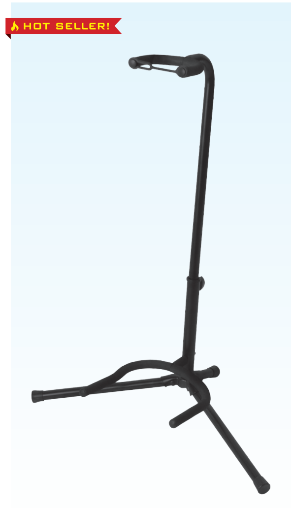
CLASSIC GUITAR STAND XCG-4 | 10728

Application: Holds one guitar. Tubing: 19mm / 33mm Height Adjustment: 19.25" - 24" Leg Housing: Sheet Metal Padding: EVA Foam Color: Rosewood & Black