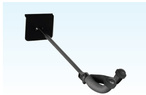
ADJUSTABLE SLAT WALL HANGER GS7650AB | 10747

Application: Hangs guitar facing straight. Length (Base To Yoke): 4.25" Length (Base To End): 6.75" Construction: Steel Padding: EVA Foam Color: Black