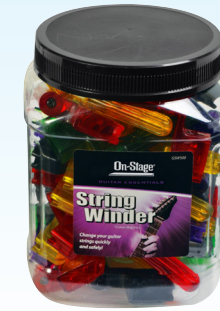
JAR OF 45 GUITAR STRING WINDERS GSW500PK | 11480

Application: Fits between ukulele strings during storage to prevent wood from drying out. Dimensions: 2.25" x 0.9" x 2"