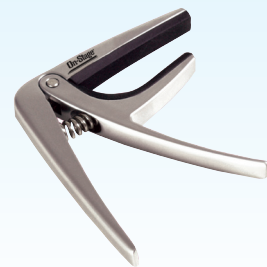
UKULELE CAPO GA200 | 10152 | CHROME GA200B | 12937 | BLACK

Application: For 6-12 string guitars. Dimensions: 3.54" x 3.15" x 0.59" Construction: Zinc Alloy Padding: Silicone