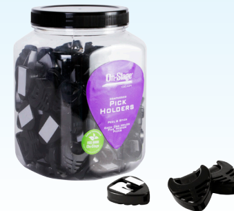
JAR OF 100 PICK HOLDERS GSAPK6500 | 48643

Application: For classical nylon string guitars. Dimensions: 3.67" x 3.41" x 0.47" Construction: Zinc Alloy Padding: Silicone