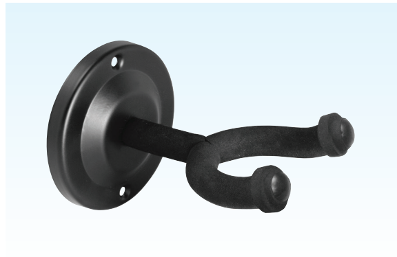
ROUND METAL GUITAR HANGER GS7640 | 11994

Application: Notches at 90° and 45° left or right. Flip-It!® yoke flips up for ease of use. Length (Base To Yoke): 12" Length (Base To End): 14.38" Construction: Steel Padding: EVA Foam Color: Black