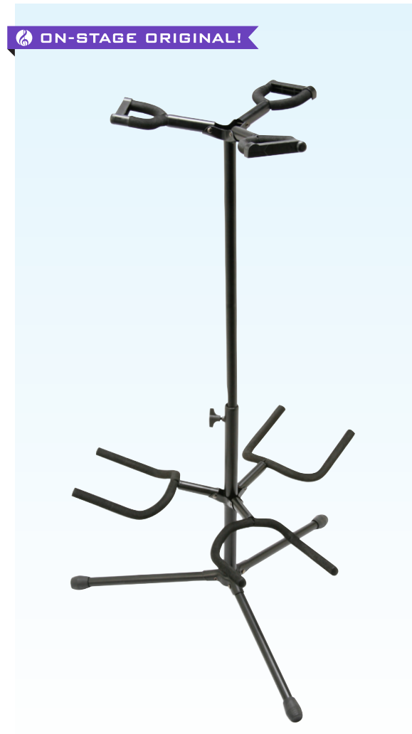
DELUXE FOLDING TRIPLE GUITAR STAND GS7321BT | 12022

Application: Holds two guitars. Height Adjustment: 19" - 33" (between upper and lower yoke) Base Spread: 22" Padding: EVA Foam Color: Black