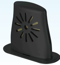
UKELELE HUMIDIFIER GA250 | 13011

Application: Fits between ukulele strings during storage to prevent wood from drying out. Dimensions: 2.25" x 0.9" x 2"