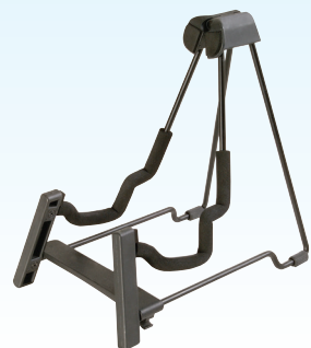
FOLK INSTRUMENT STAND GS5000 | 10588

Application: Holds one guitar. Base Spread: 5.12" Folded Dimensions: 11.42" x 11" x 1.25"