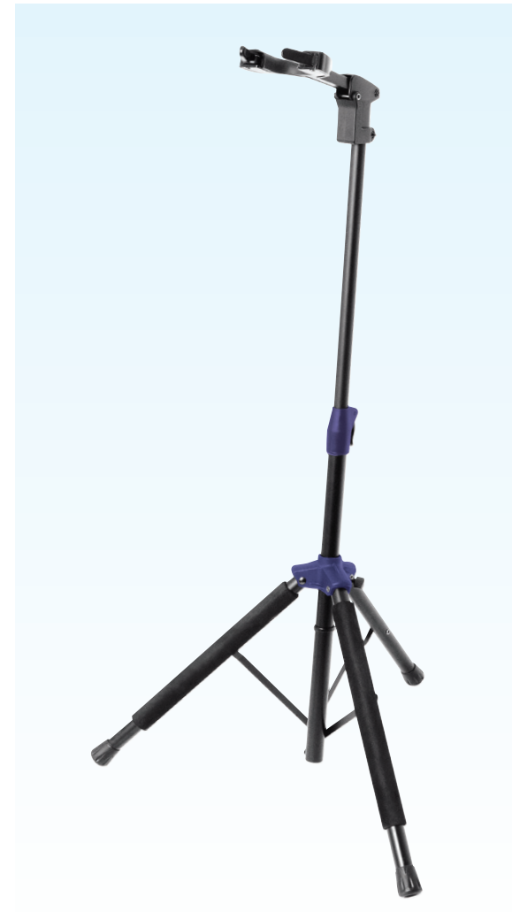
PROGRIP II GUITAR STAND GS8200 | 10710

Application: Holds one guitar. Tubing: 17mm / 25mm Height Adjustment: 30" - 43" Weight Capacity: 36 lbs. Construction: Steel Leg Housing: Reinforced Nylon Clutches: Aluminum Upper Shaft Padding: EVA Foam Color: Black