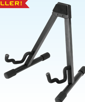
PRO A-FRAME GUITAR STAND GS7462B | 11239

Application: Holds one guitar. Tubing: 1" x 1"