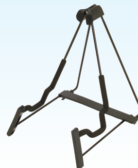
A-FRAME GUITAR STAND GS7655 | 10592

Application: Holds one guitar. Base Spread: 6.25"-10.75" Folded Dimensions: 15.5" x 13" x 1.25"