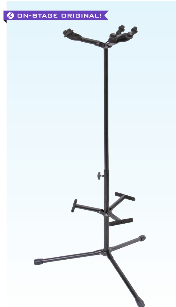
HANG-IT TRIPLE GUITAR STAND GS7355 | 10721

Application: Holds two guitars. Tubing: 19mm / 25mm Height Adjustment: 36" - 42" Leg Housing: Sheet metal Padding: EVA Foam Color: Black