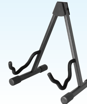
A-FRAME GUITAR STAND GS7362B | 10725

Base Spread: 5.25" Weight: 0.25 lbs. Color: Black, Grey, Purple Accents