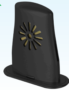
GUITAR HUMIDIFIER GA150 | 13015

Application: Fits between guitar strings during storage to prevent wood from drying out. Dimensions: 3" x 1.25" x 3.3"