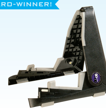
MIGHTY UKE STAND GS6000B | 10087

Application: Holds one guitar. Yoke Depth Adjustment: 2.5"-3.5" Folded Dimensions: 8.5" x 3.5" x 1.25"