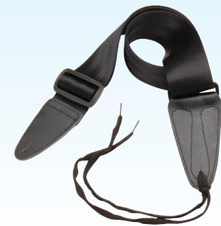
NYLON GUITAR STRAP GSA20BKSB | 48637

Length Adjustment: 46" - 72" Color: Black Material: Nylon & Plastic