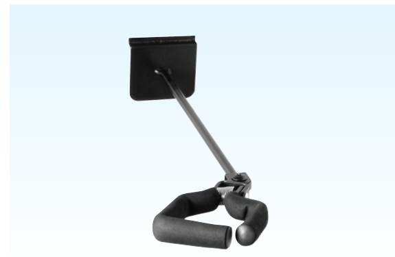
ADJUSTABLE FLIP IT!® HANGER GS7660B | 10706

Application: Hangs guitar facing straight, left or right. Length (Base To Yoke): 10.5" Length (Base To End): 13" Construction: Steel Padding: EVA Foam Color: Black