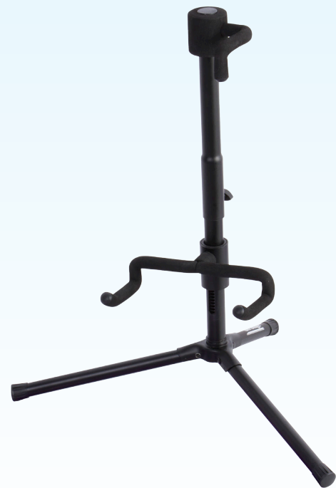
PUSH DOWN SPRING-UP LOCKING ELECTRIC GUITAR STAND GS7140 | 12561

Application: Holds one guitar. Construction: Steel Weight: 2.6 lbs. Padding: EVA Foam