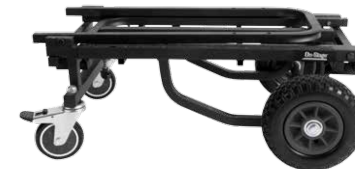
UTC2200 | Utility Cart (page 79)