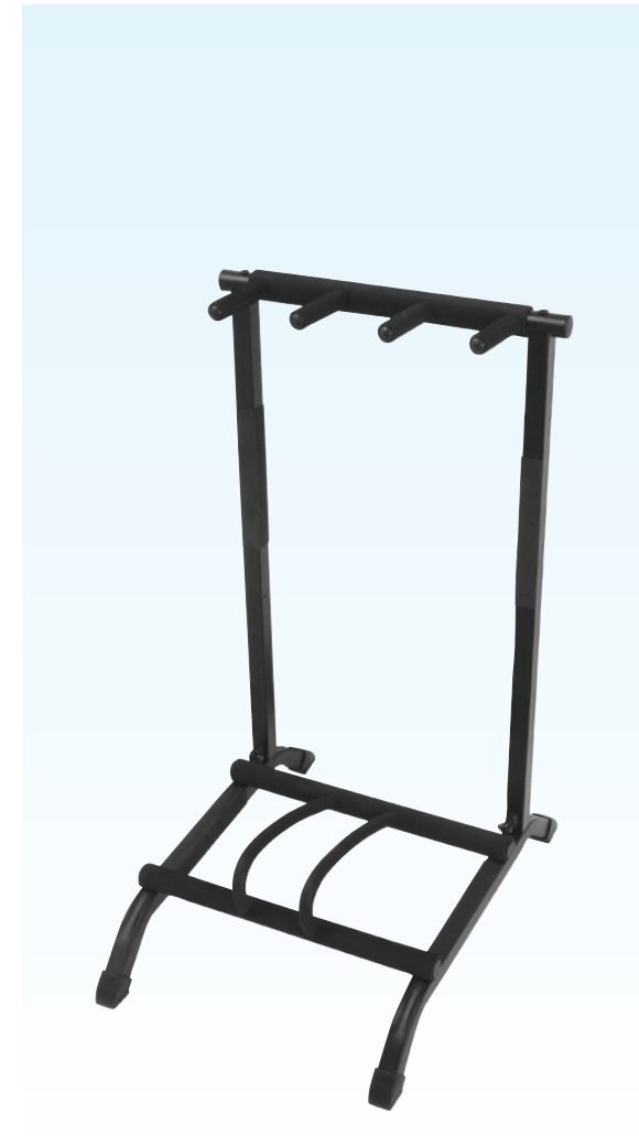
3-SPACE GUITAR RACK GS7361 | 10461

Application: Holds one guitar. Tubing: 17mm / 25mm Height Adjustment: 30" - 43" Weight Capacity: 40 lbs. Construction: Steel Leg Housing: Reinforced Nylon Padding: EVA Foam Color: Black & Purple