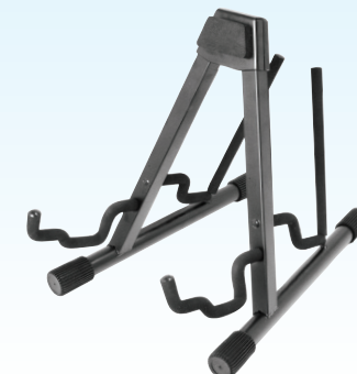
PRO DOUBLE A-FRAME GUITAR STAND GS7462DB | 10760

Application: Holds two guitars. Tubing: 1" x 1"