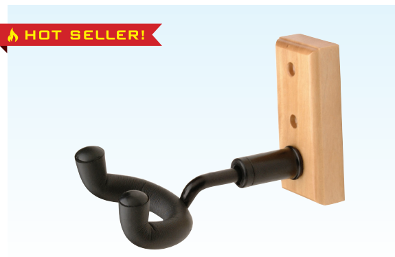
MINI WOOD WALL GUITAR HANGER GS7730 | 12035

Application: Hangs guitar facing straight. Construction: Steel Padding: EVA Foam Color: Black