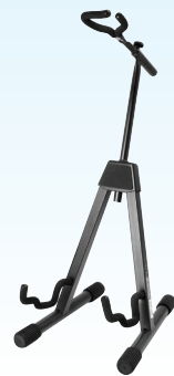
FLIP-IT!® A-FRAME GUITAR STAND GS7465B | 12912

Color: Black Patent Pending Design POP Display Available.