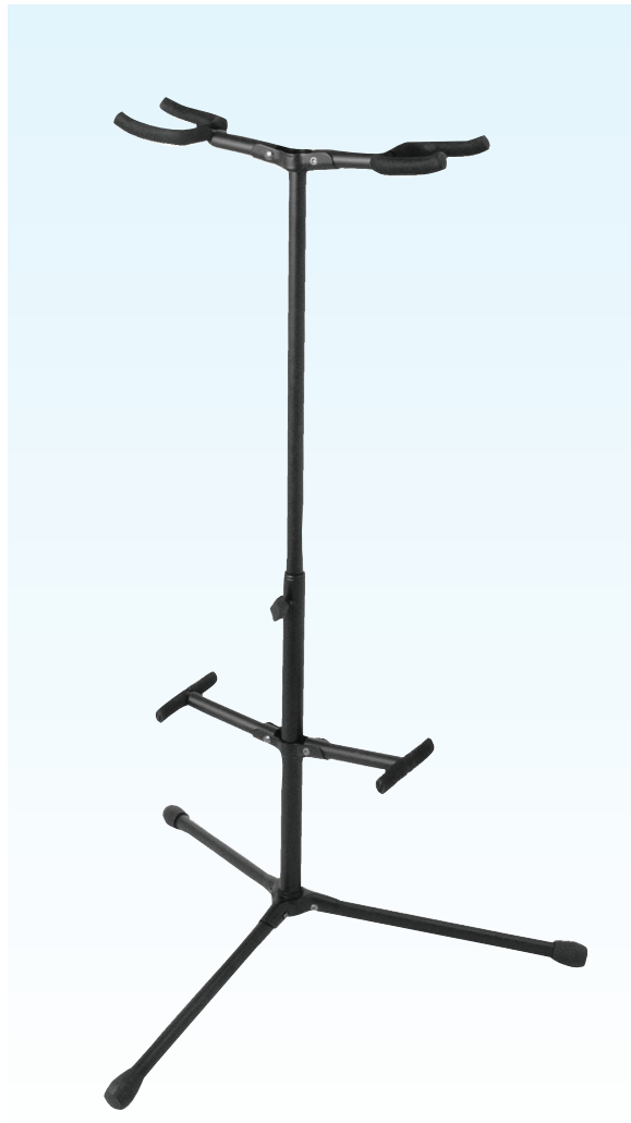
HANG-IT DOUBLE GUITAR STAND GS7255 | 10749

Application: Holds two guitars. Tubing: 19mm / 25mm Height Adjustment: 36" - 42" Leg Housing: Sheet metal Padding: EVA Foam Color: Black