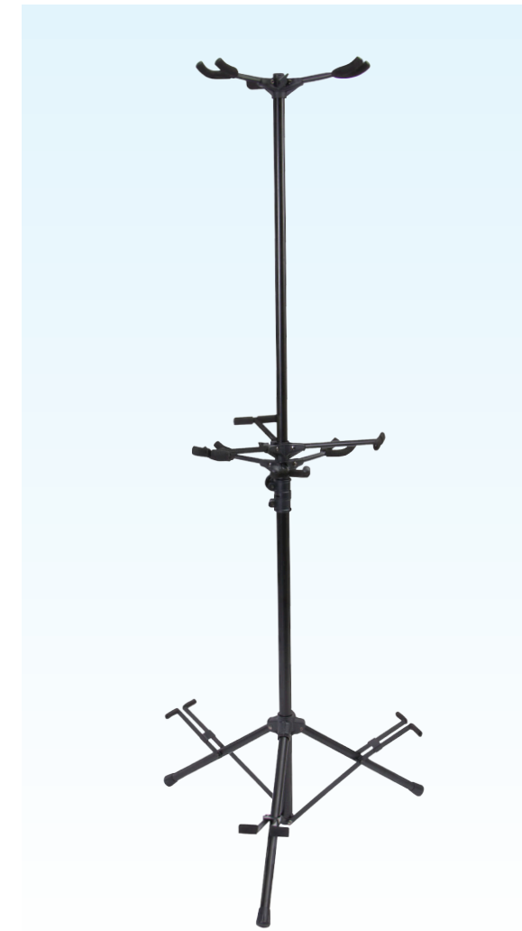
SIX GUITAR STAND GS7652B | 12975

Application: Holds three guitars. Height Adjustment: 17" - 32" (between upper and lower yoke) Base Spread: 22" Padding: EVA Foam Color: Black Patent Pending Design