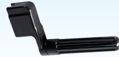
GUITAR STRING WINDER GSW500 | 10580

Application: For any guitar or small folk instrument. Construction: Plastic Colors: Black, Green, Yellow, Purple, Red