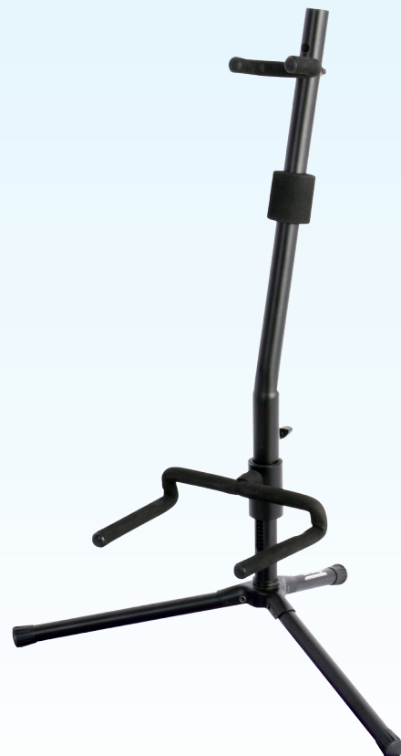
PUSH DOWN SPRING-UP LOCKING ACOUSTIC GUITAR STAND GS7141 | 12568

Application: Holds one guitar. Construction: Steel Weight: 2.7 lbs. Padding: EVA Foam