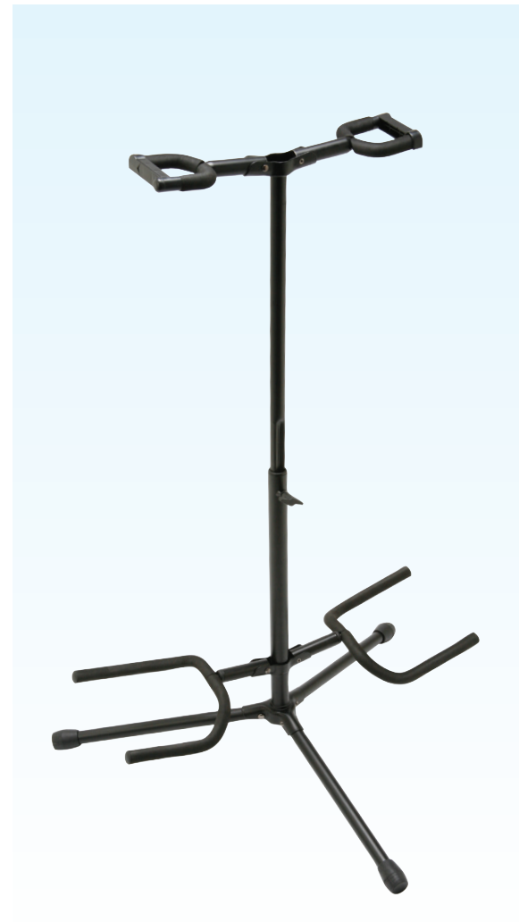
DELUXE FOLDING DOUBLE GUITAR STAND GS7221BD | 10748

Application: Holds one guitar. Tubing: 17mm / 22mm Height Adjustment: 19.25" - 24" Leg Housing: Heavy-Duty Sheet Metal Padding: EVA Foam Color: Black