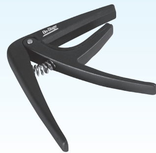
GUITAR CAPO GA100 | 10139

Application: General guitar care. Guitar Polish: 4oz. All-natural and eco-friendly. Soft Microfiber Cleaning Cloths: 7.75" x 7.75" Celluloid Pick Thickness: 0.46mm, 0.71mm & 0.96mm Guitar String Winder: For any guitar or small folk instrument.