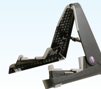
MIGHTY GUITAR STAND GS6500 | 10487

Application: Holds one guitar. Yoke Depth Adjustment: 3.15"-1.25" Folded Dimensions: 12.25" x 5.85" x 1.65"