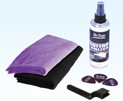
UNIVERSAL GUITAR CARE KIT GK7000 | 10591

Application: For any guitar or small folk instrument. Construction: Plastic