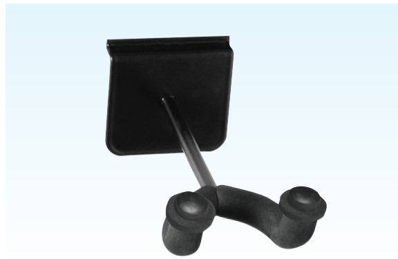
STRAIGHT SLAT WALL HANGER GS7650SB | 10711

Application: Hangs guitar facing straight. Length (Base To Yoke): 4.25" Length (Base To End): 6.75" Construction: Steel Padding: EVA Foam Color: Black