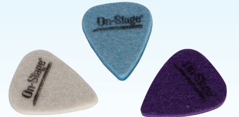
SOFT UKELELE PICKS UPK300 | 12979

Dimensions: 25mm x 30mm Construction: Soft Felt Material Color: White, Blue, Purple Includes: 3 picks