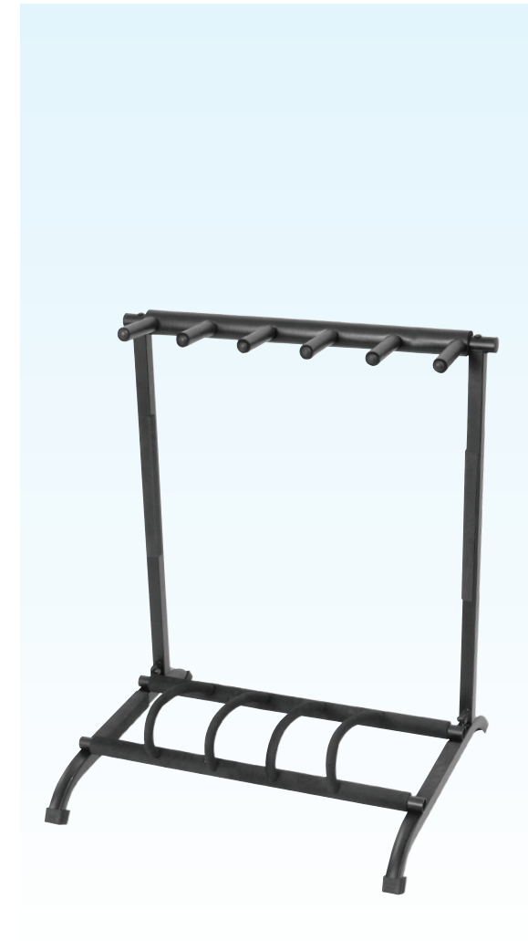
5-SPACE GUITAR RACK GS7561 | 10587

Application: Holds three guitars. Height: 29" Folded Dimensions: 20" x 30" x 6" Base Spread: 15" x 20" Padding: EVA Foam Color: Black