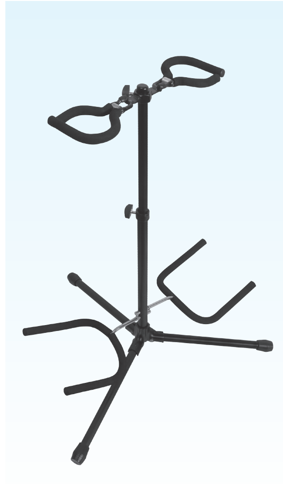
FLIP-IT!® DUO GUITAR STAND GS7253B-B | 12513

Application: Holds one guitar. Height Adjustment: 23"x 29" Tubing: 19mm / 22mm Padding: EVA Foam Leg Housing: Die-Cast Color: Black