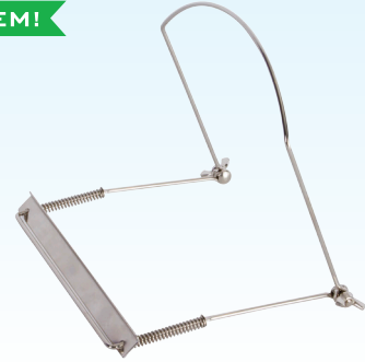
HARMONICA HOLDER IHH1020 | 12913

Application: Holds 10-20 hole harmonicas. Construction: All metal