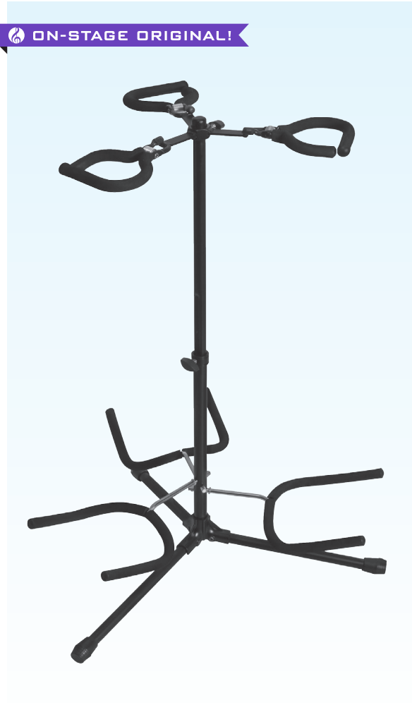
TRI FLIP-IT!® GS7353B-B | 12512

Application: Holds two guitars. Height Adjustment: 23"x 29" Tubing: 19mm / 22mm Padding: EVA Foam Leg Housing: Die-Cast Color: Black