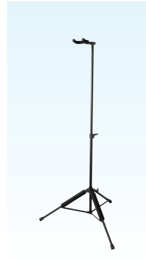
HANG-IT SINGLE GUITAR STAND GS7155 | 10720

Application: Holds six guitars. Tubing: 25mm / 30mm Leg Housing: Hi-impact Plastic Padding: EVA Foam Color: Black