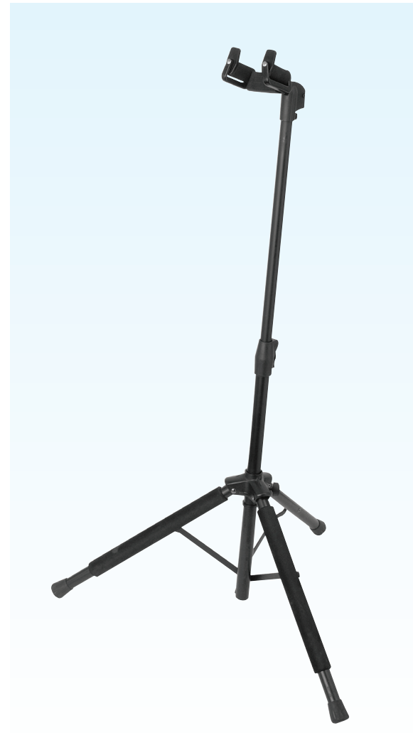
PROGRIP GUITAR STAND GS8100 | 10704

Application: Holds three guitars. Tubing: 19mm / 25mm Height Adjustment: 36" - 42" Leg Housing: Sheet Metal Padding: EVA Foam Color: Black Patent Pending Design