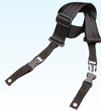
CLICK-IT GUITAR STRAP GSA6230 | 49748

Length Adjustment: 46" - 72" Color: Black Material: Nylon & Plastic