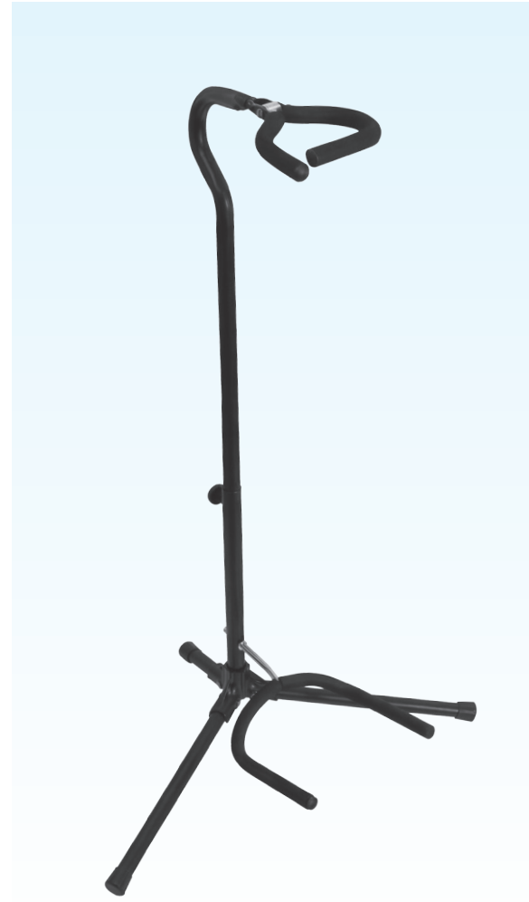
FLIP-IT!® GRAN GUITAR STAND GS7153B-B | 12514

GPB4000 | GUITAR/KEYBOARD PEDAL BOARD NAMM BEST IN SHOW AWARD WINNER (PAGE 21)