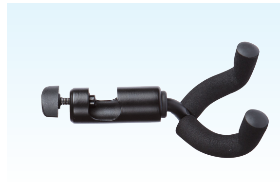
U-MOUNT® GUITAR HANGER GS7800 | 10648

Application: Hangs guitar facing straight. Weight Capacity: 8 lbs. Construction: Pine & Steel Padding: EVA Foam Color: Black & Maple