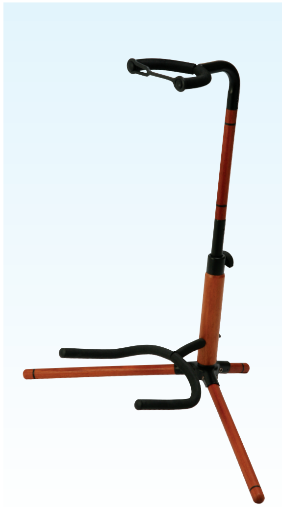
WOODEN GUITAR STAND WGS-100 | 10722

Application: Holds one guitar. Tubing: 19mm / 33mm Height Adjustment: 19.25" - 24" Leg Housing: Sheet Metal Padding: EVA Foam Color: Rosewood & Black